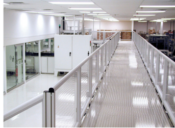
RAILINGS & WALKWAYS