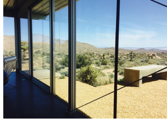
WINDOW & DOORWAY FRAMES